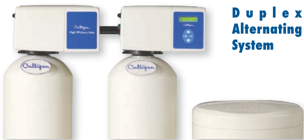
Duplex Alternating System

The Culligan® HE Duplex Alternating Twin provides uninterrupted conditioned water 24 hours a day.