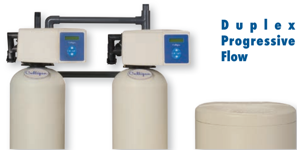
Duplex Progressive Flow

The duplex alternating system benefits from upflow** proportional regeneration, which allows up to 24% higher capacity at the same salt dosage when compared to down flow systems.